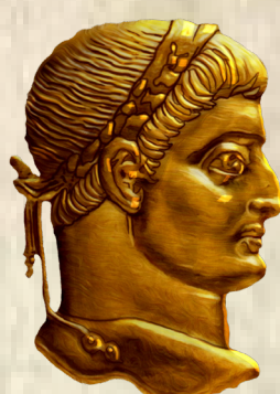
CONSTANTINUS I 312 - 337