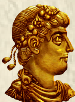
GRATIANUS 375 - 383