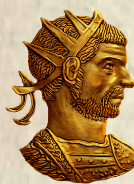
AURELIANUS 270 - 275