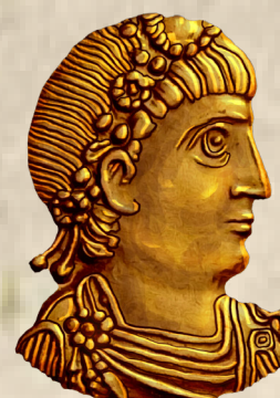
CONSTANTIUS III 421