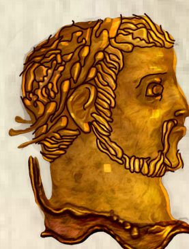
MAXIMINUS DAIA 311 - 313

INSTITUTE OF ARCHAEOLOGY, BELGRADE PARCO ARCHEOLOGICO DEL COLOSSEO