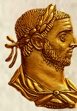
PROBUS 276 - 282