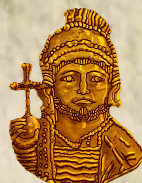
IUSTINIANUS I 527 - 565