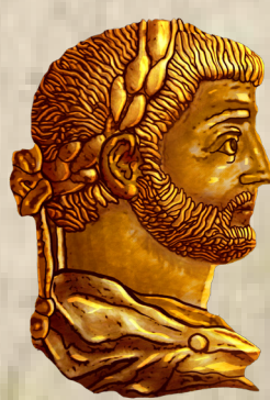
GALERIUS 305 - 311