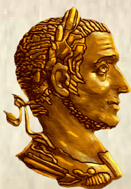
TRAIANUS DECIUS 249 - 251