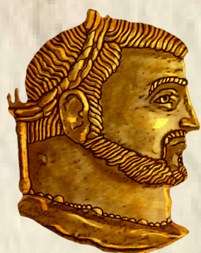
LICINIUS 308 - 324

Tuesday, May 16 th 2023, 06:00 PM / 18:00 Roman Senate – Curia Iulia Rome