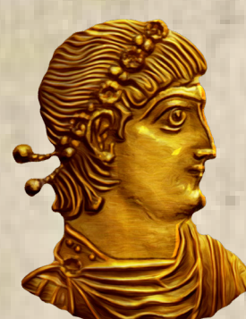
CONSTANTINUS II 337 - 340