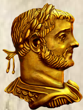
MAXIMIANUS HERCULIUS 285 - 305, 310