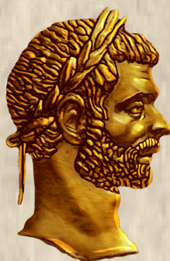
CLAUDIUS GOTHICUS 268 - 270