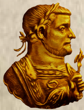
CONSTANTIUS I CHLORUS 305 - 306