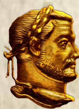
FLAVIUS SEVERUS 306 - 307